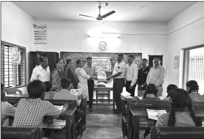
Donation of Educational Supplements to the students of Govt Higher Primary School Bokkapatna by our Club.