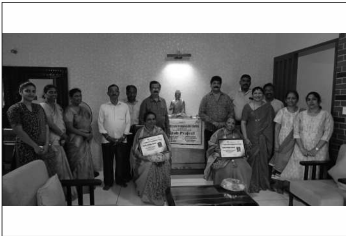
Donation of Essential items to Hosa Belaku Bailur by our Club