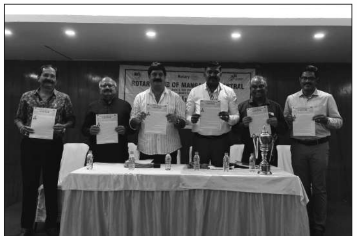
Release of Centor by the Hosts of the Family Dinner Meeting of the Club for August