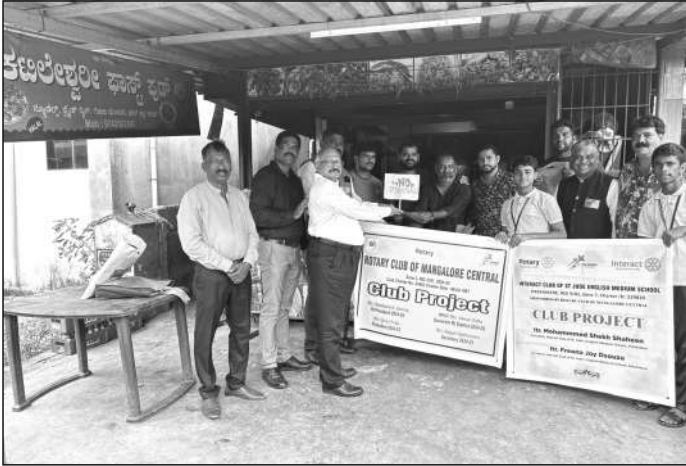
“Say No to Plastics” campaign conducted by our Club at Suragiri Enterprises Pakshikere