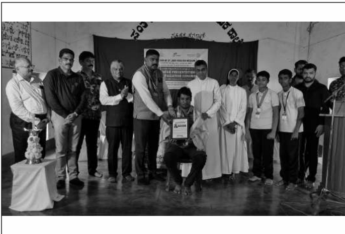
“Say No to Plastics” campaign conducted by our Club at Hotel Swagath Pakshikere